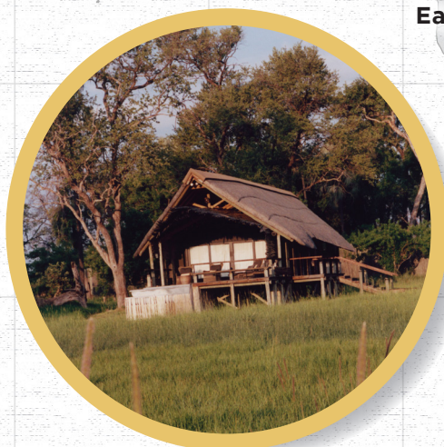
Eagle Island Lodge Botswana