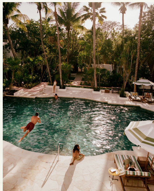
MAROMA Riviera Maya