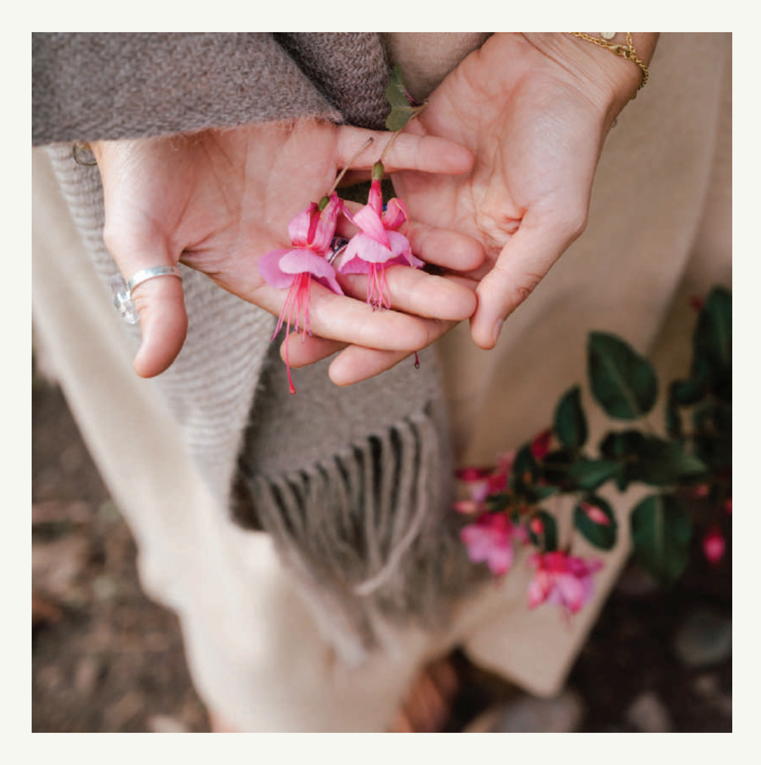
YOGA, MIND & SOUL