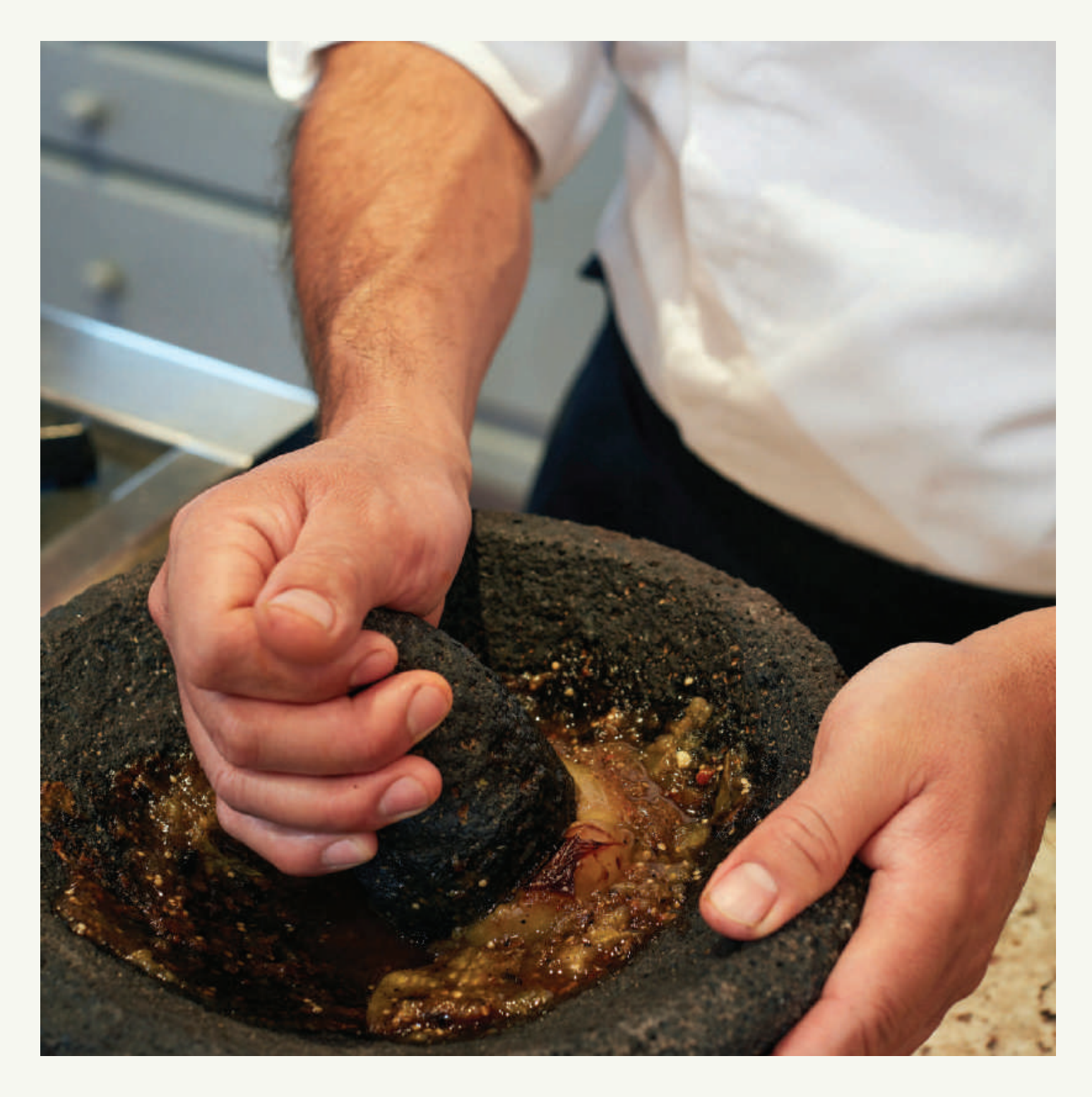
SALSAS DE MÉXICO