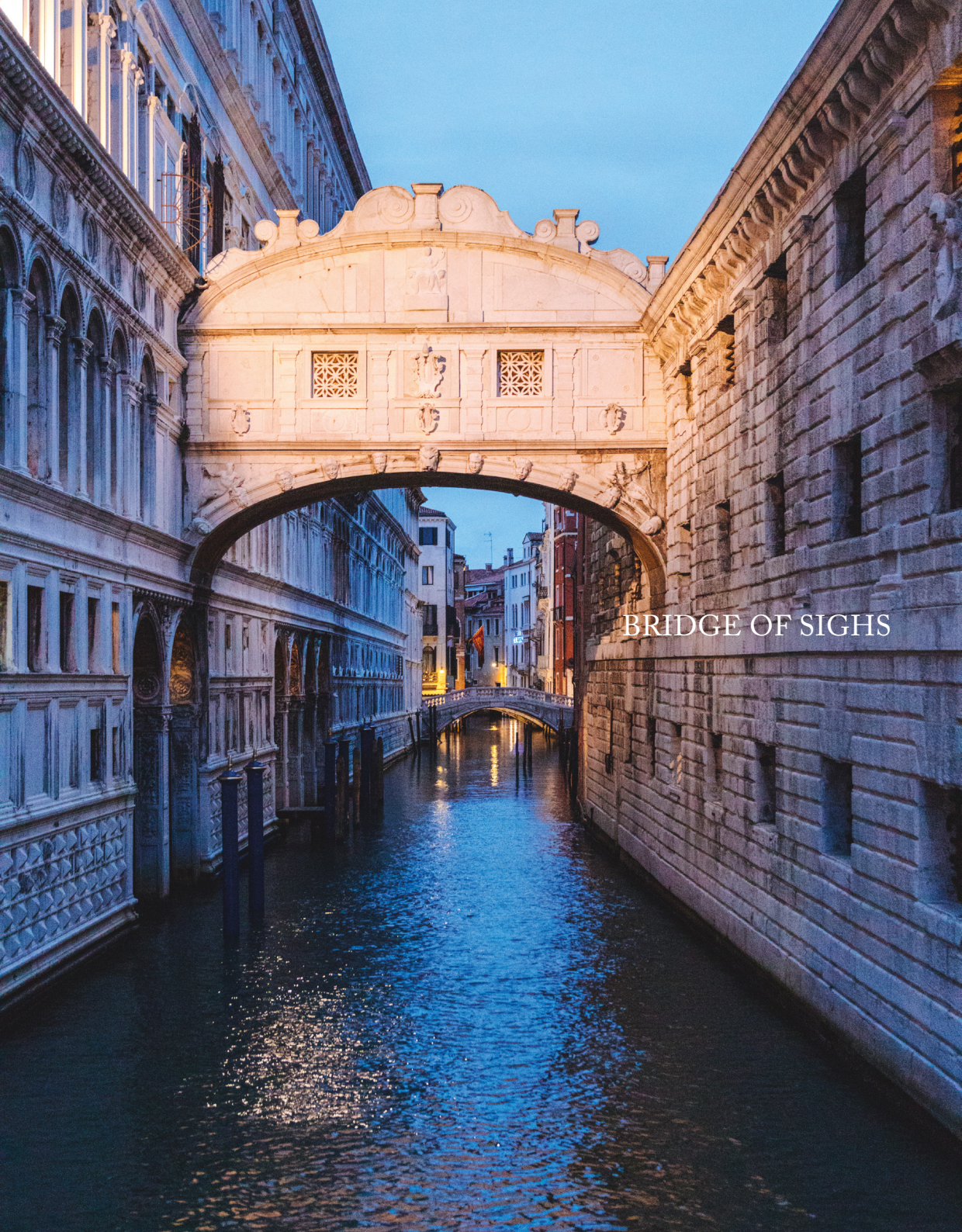
BRIDGE OF SIGHS