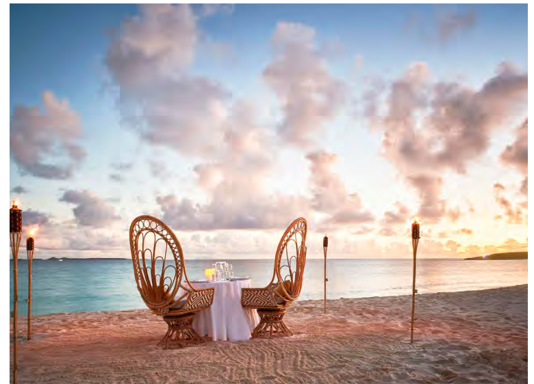
CAP JULUCA, A BELMOND HOTEL, ANGUILLA